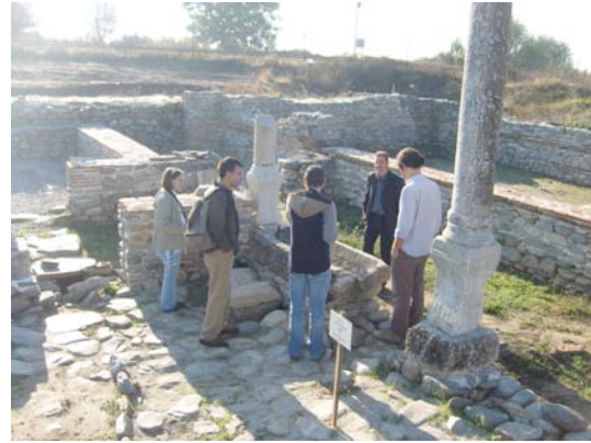
Visiting Nicopolis ad Nestum, SW Bulgaria