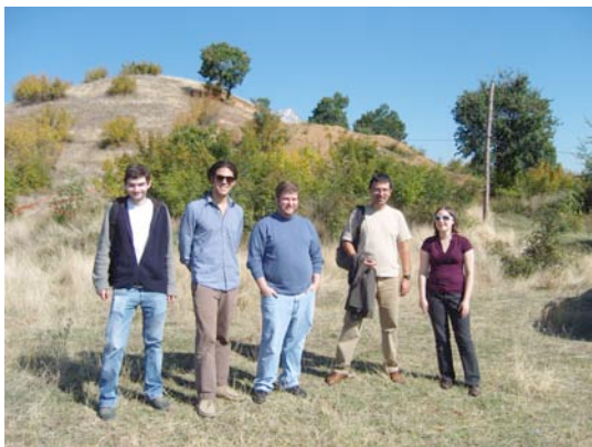
The Fellows at the Thracian tumulus at Karanovo, noted for its chariot and aristocratic burial of the Roman period