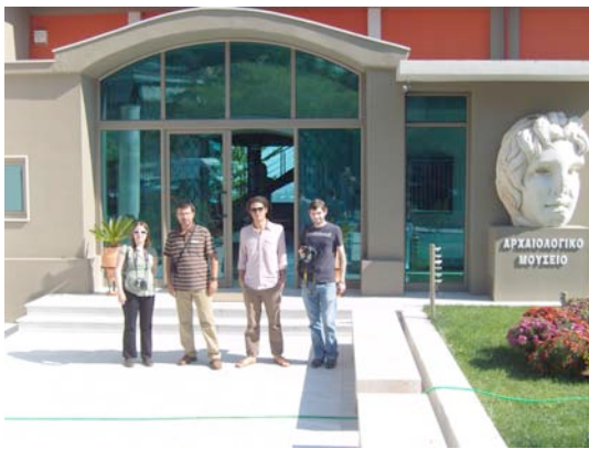
The Archaeological Museum in Veria