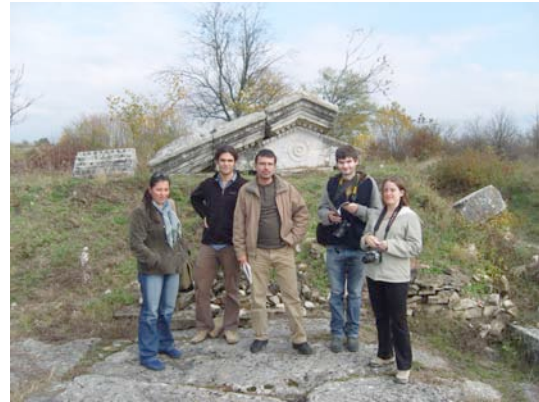
At the agora of Nicopolis ad Istrum