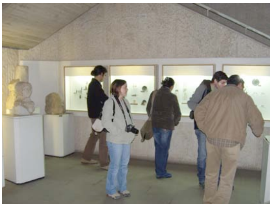
The Regional Museum of History in Vratsa, NW Bulgaria