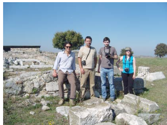
The ARCS group at Amphipolis