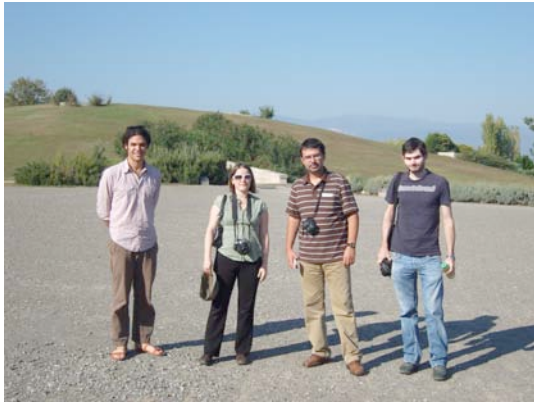
In front of Megali Toumba in Vergina