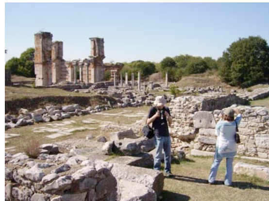
ARCS Fellows taking photos of the impressive remains of Philippi