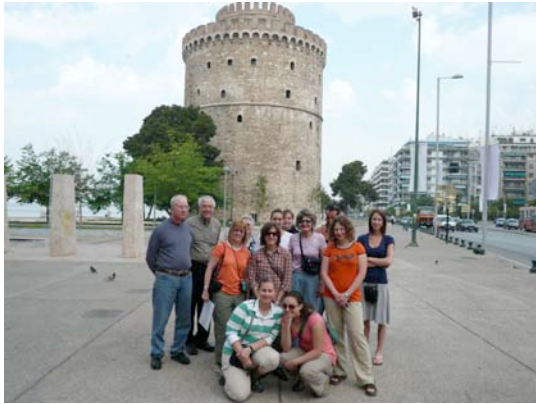
The University of Alaska Anchorage group at the White Tower in Thessaloniki