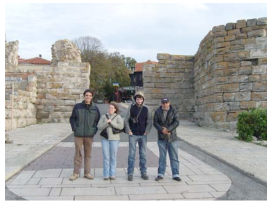
At the windy gate of Mesambria on the Black Sea coast