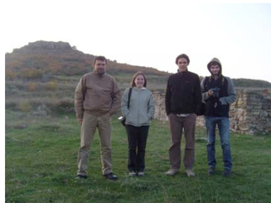
Visiting ancient Kabyle