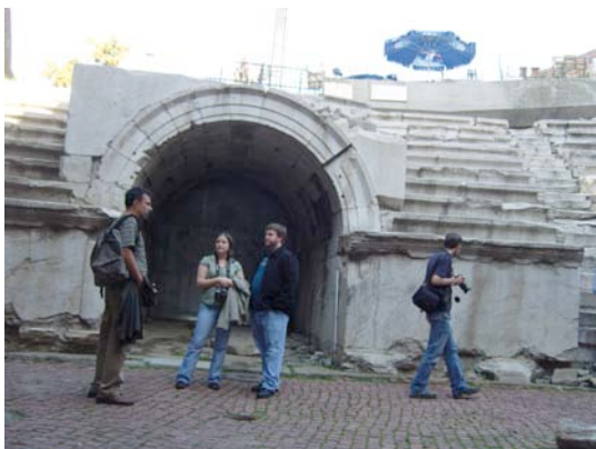
The Roman stadium in Philippopolis